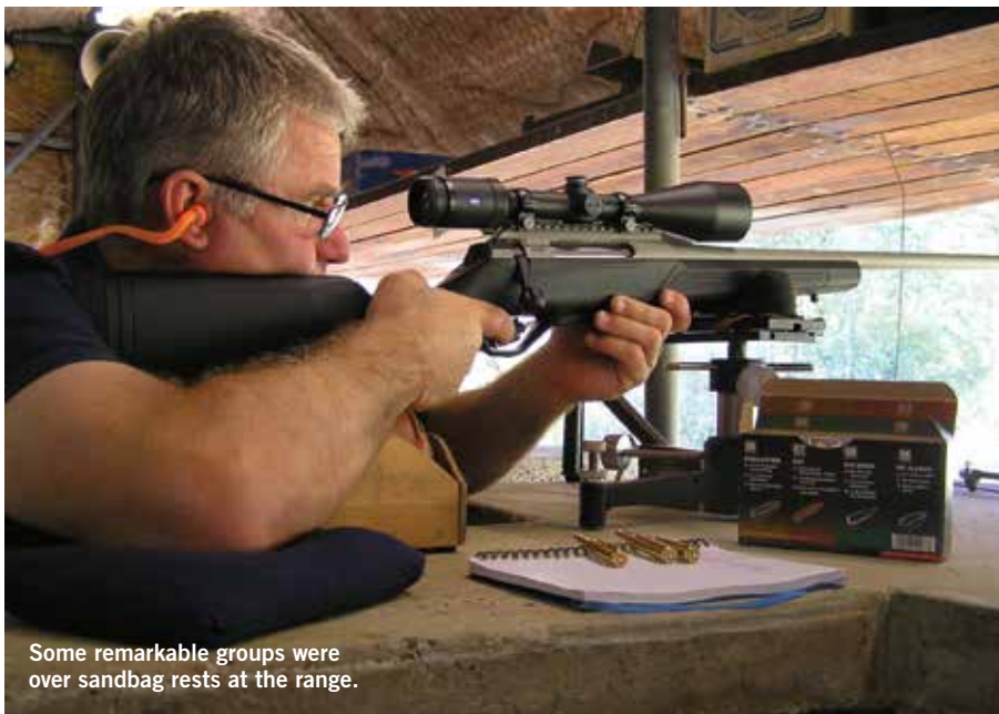
Some remarkable groups were over sandbag rests at the range.

Sporting rifle manufacturing has a patchy history in Australia. Lithgow Arms (LA) have now added the robust and highly accurate LA102 Crossover centrefire range to their successful LA101 rimfires.